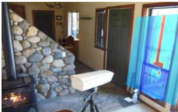
Figure 1: Ecolux 70 on the upper pane reflecting the heat of the fireplace back into the room