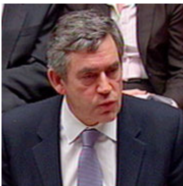
Gordon Brown delivering his Commons' statement

Here are the key points of the Prime Minister's security statement to the House of Commons.