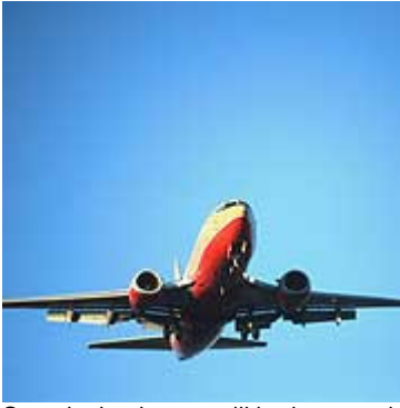
Security in airports will be improved

of communities in the UK, the Government will challenge extremist propaganda and support alternative voices; support individuals who may be being targeted; and address concerns exploited by extremists.