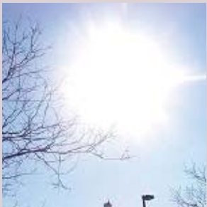
Glass without film

Reduce your CO 2 emissions today with Solartek STKCO 2 film.