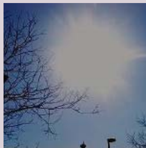
Glass with an equivalent solar film