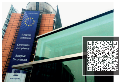
European Commission Quarters Graffiti Gard offers a layer of protection for the glass in 34 public elevators.