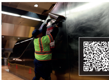
LA Metro, Los Angeles, USA Metal Shield is installed on over 100 metro stations in Los Angeles.